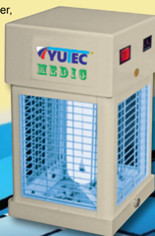
MED-15W Height = 360