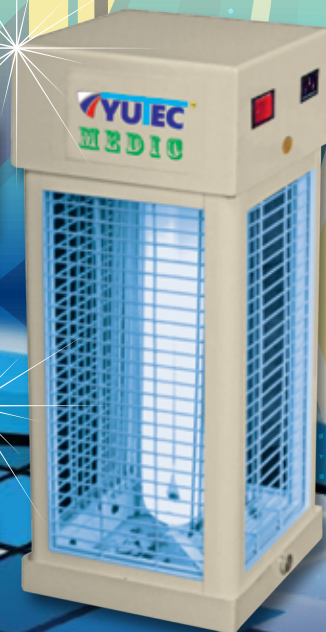
MED-40W Height = 475